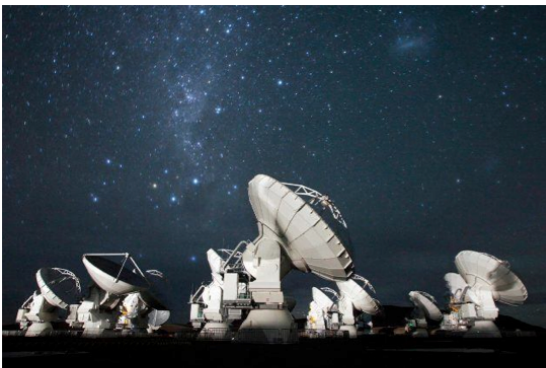
Figure 3: The Atacama Large Millimetre/submillimetre Array (ALMA) in Chile.

ALMA (see Figure 3) consists of three telescope arrays: i) a “12-m Array” of fifty 12-m diameter antennas that can be separated by ~15 km for higher-resolution observations; ii) a “Compact Array” of twelve 7-m diameter antennas fixed to a maximum separation of 33 m for lower-resolution observations; and iii) a “Total Power Array” of four 12-m diameter antennas which provide low spatial frequency (single-dish) data for combination with the other arrays. The arrays are used separately, but the latter two are used exclusively to obtain data complementary to 12-m Array data, and are not used independently for large-scale surveys of SMM emission. ALMA is located in northern Chile at an altitude of ~5000 m, and can presently observe emission from 84 GHz to 950 GHz 2 .