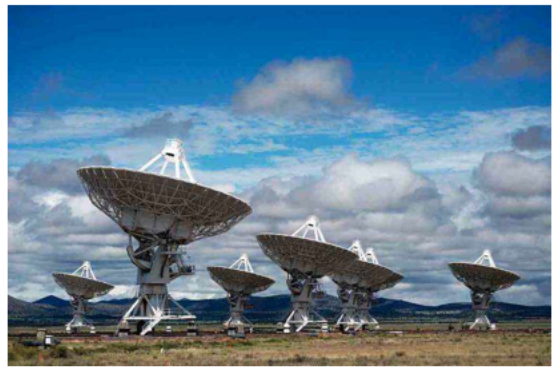
Figure 4. The Karl G. Jansky Very Large Array on the Plains of San Agustin in New Mexico.

The Karl G. Jansky Very Large Array (VLA; see Figure 4) is the end result of the "Expanded Very Large Array" (EVLA) project, a significant upgrade to the observational capabilities of the Very Large Array operated in New Mexico by the U.S. National Radio Astronomy Observatory (NRAO). The VLA can now observe from 1-50 GHz 3 , and the highest of these frequencies overlap with the longest SMM wavelengths (~10 mm). It consists of twenty-seven 25-m antennas with maximum baselines of ~36 km. To partner with the U.S. in ALMA, Canada and the NRAO formed the North American Partnership in Radio Astronomy (NAPRA), allowing Canadians access to NRAO facilities, including the VLA.